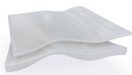
Sheet 4x4in 0.1 or 0.5in thick

KerraPro Pressure Reducing Pads must only be used on healthy, intact or recently healed skin.